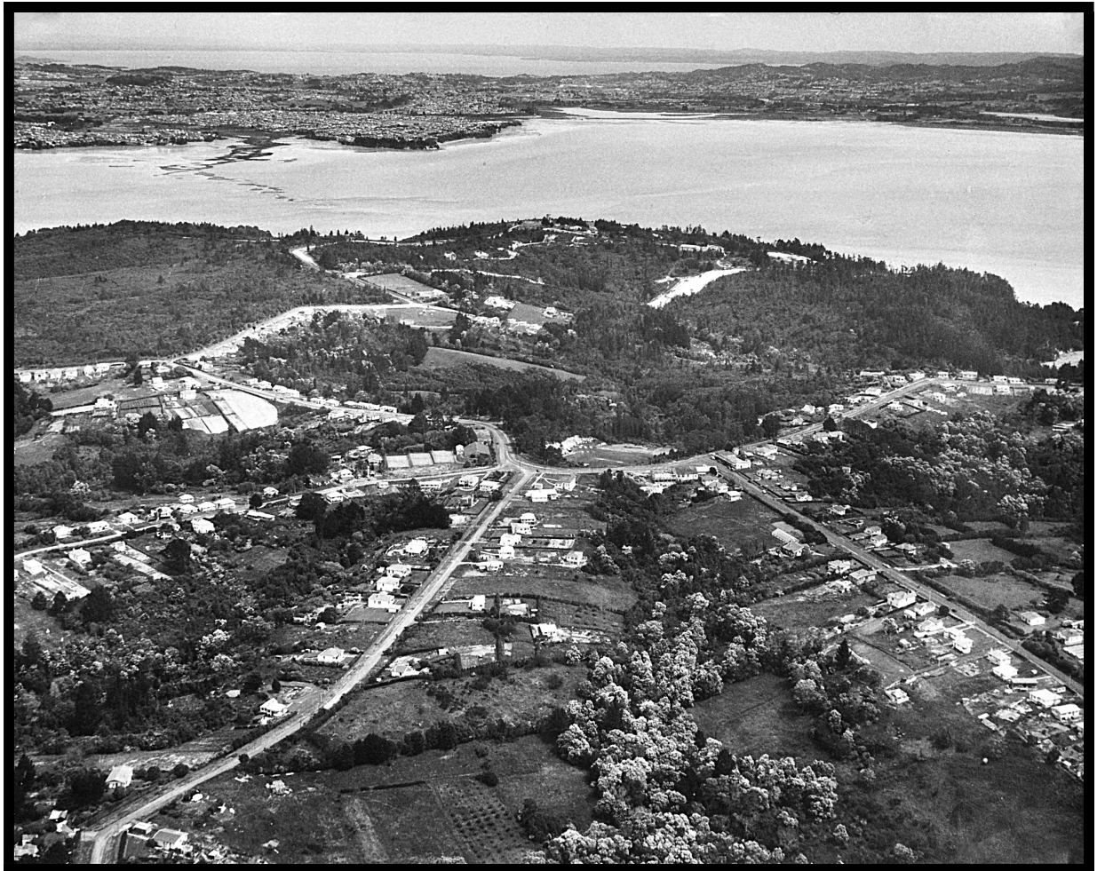
Birkdale by Air

Birkenhead Historical Society PO Box 34419 Birkenhead Auckland 0746