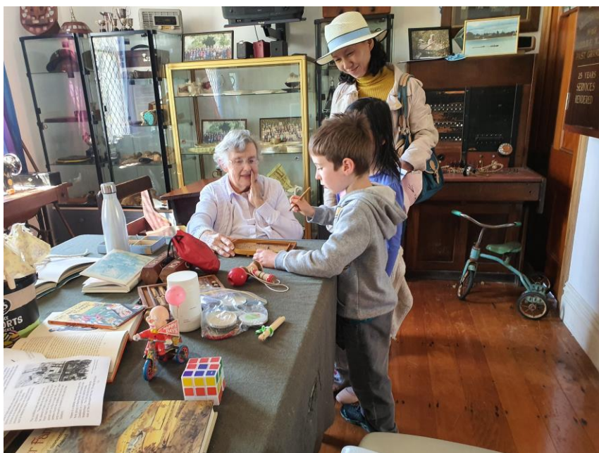
Photo - our Children's Activity – 'Games that children played aboard ship'

Auckland Heritage Festival Theme 2019 'Our People Travelled to Tāmaki Makaurau by Sea, Air or Land'