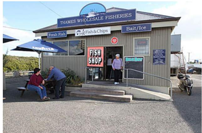
Fish for dinner tonight