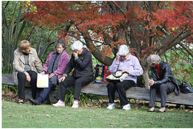
Sitting a spell before carrying on