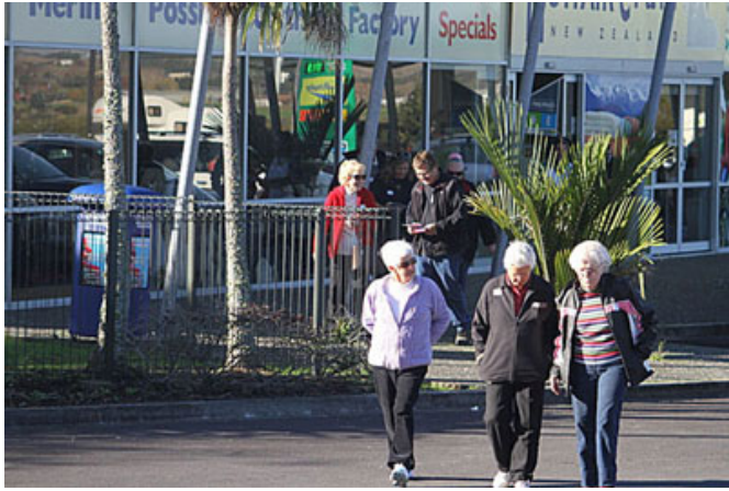
Our first stop on way to Thames