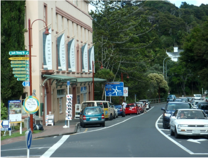
Driving through Titirangi