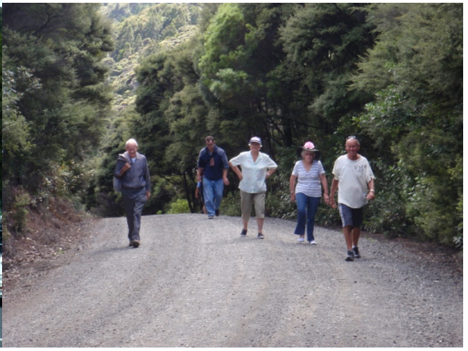
Walking to Huia Lookout