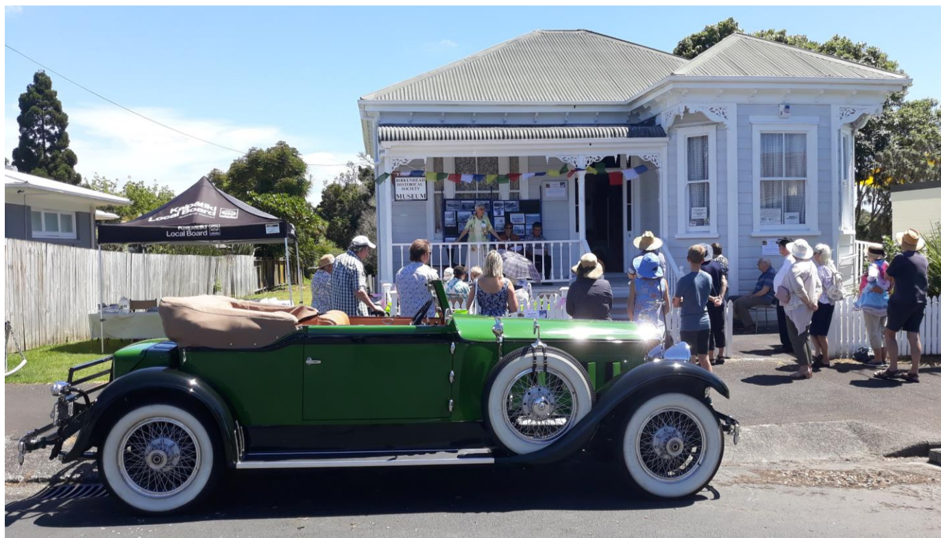
Members and guests at the Reopening of Farrington House Museum

SPECIAL EVENT held at Farrington House 13 th February