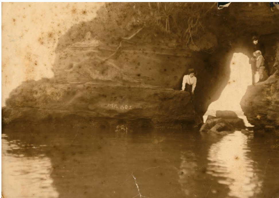
‘Needles Eye’ Little Shoal Bay - 1910